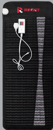
Midsize 59" x 24" 150cm x 60cm