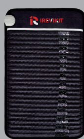
Small Size 31" x 20" 80cm x 50cm